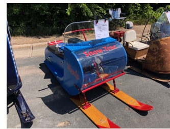
1963 Snow Track Bill Thelemann - Le Sueur